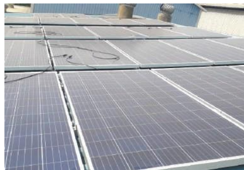
7Kw Shubh Neel Chemical, Bhosari