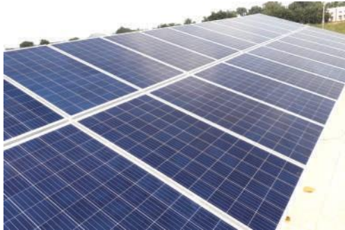
10Kw Pais Petroleum, Sangamner