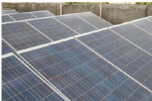
10Kw Residential Highschool, Shevgaon