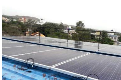
10Kw Walunj Hospital, Shirur