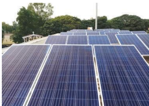
5Kw Hira Stationers, Ahmednagar