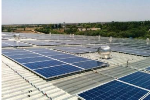
50Kw Kroslink Polymers Pvt. Ltd. , Bhosari, Pune