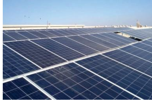
80Kw Changa Oil Mill, Pathardi