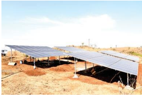
30 HP Solar Water Pump, Dindori, Nashik