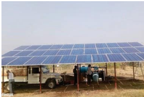
10 HP Solar Water Pump, Phondshiras, Solapur