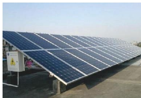
10Kw On Petrol Pump, Jalgaon