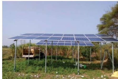
15 HP Solar Pump, Bramhani, Newasa