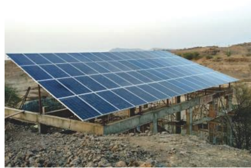
20HP Solar Water Pump, Snehalaya, A.Nagar